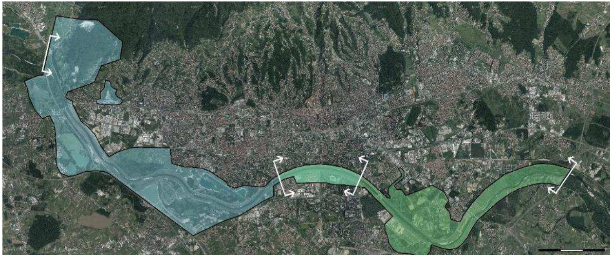
Fig. 1: Competition corridor

The problems and challenges of regulating and designing the riverbed and the banks of the Sava River have been intriguing and open for some fifty years, sometimes provoking controversy and quite the opposing opinions. Therefore, its importance for the city's survival in terms of flood protection, water management and river hydropower potential is unquestionable, but it is far more uncertain as to its future use, how it connects with the rest of the city, the way of planning and landscape design of future urban and landscape features. In this sense, the space between