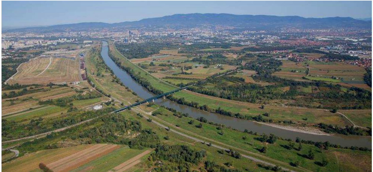
View on the city of Zagreb with Sava River

The International Student Competition is part of the 8 th Landscape Forum of the LE:NOTRE Institute. This event will be hosted by the Department of Ornamental Plants, Landscape Architecture and Garden Art, Faculty of Agriculture, University of Zagreb from April 9 – 13, 2019.