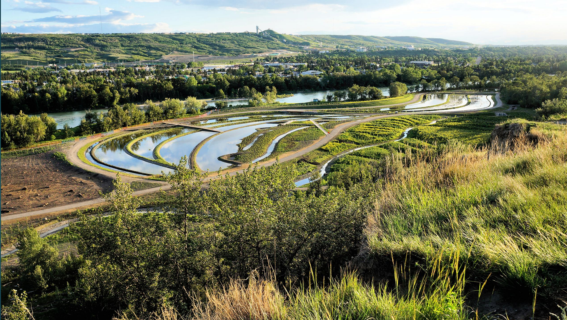
Scenery Parks Rivers Bowmont Park Calgary, Canada