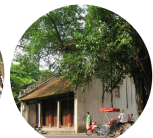
Ba Kieu Temple