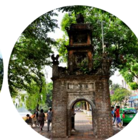
Hoa Phong Tower