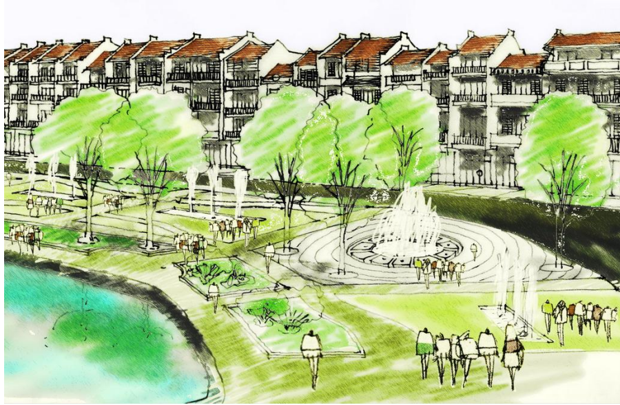
Renovation ideas of 1+1>2 Architecure Office