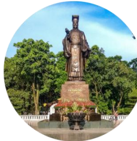
King Ly Thai To Statue