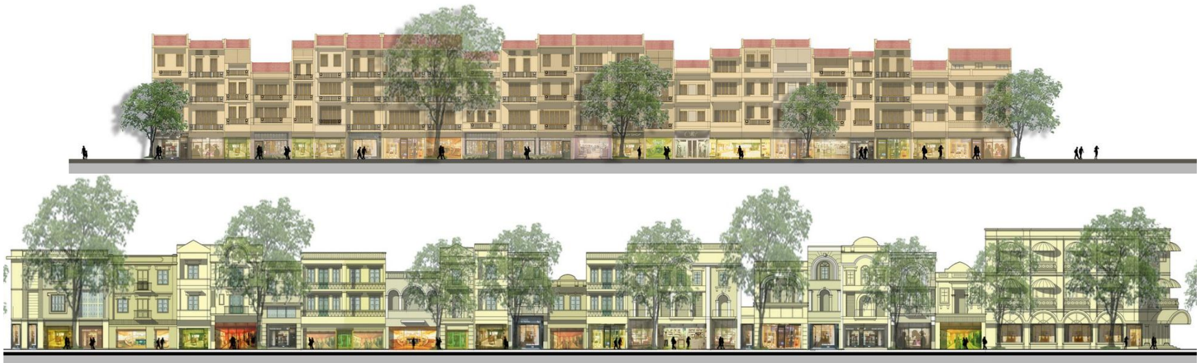
Building renovation ideas of 1+1>2 Architecure Office