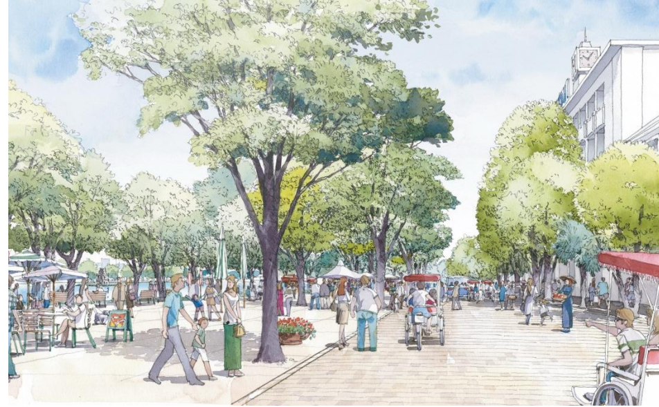
Renovation ideas of Nikken Sekkei civil company