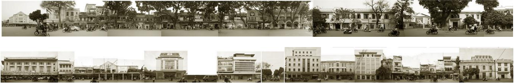
Current situation of building facades