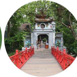
Ngoc Son Temple