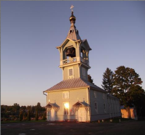
Orthodox church in Rēzekne