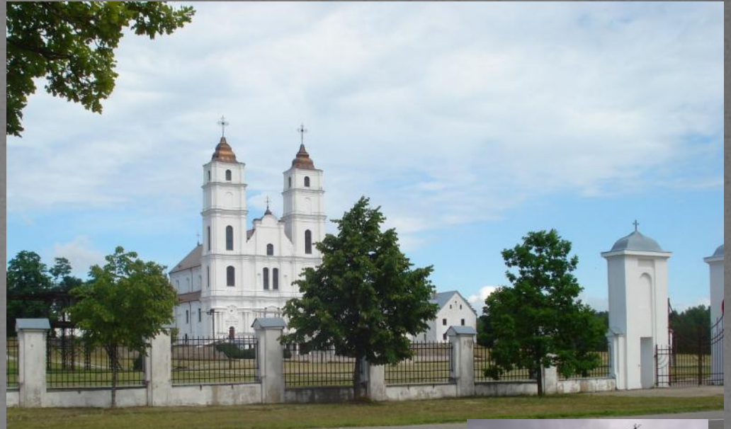
Catholic basilica in Aglona