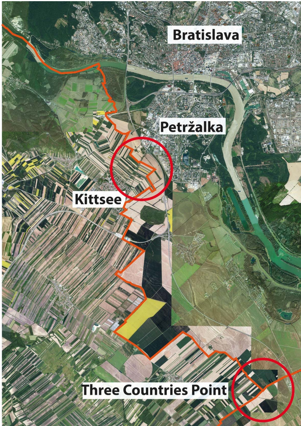
Fig. 1: Competition area at the landscape scale showing the cross-border corridor – area for the landscape analysis and landscape concept